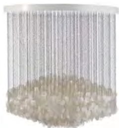
FUN 7DM (1964)

Dimension: Ø100 cm (39.4") / H: 110 cm (43.3") Description: Hanging lamp with one large cluster of mother of pearl discs. Attached by chains of small metal rings. Ceiling fitting: White wooden ceiling plate (incl.) Cord: Transparent cord Light source: 220V (110V) E27 (E26) 1 x max. 100W Art.no. EU: 10630606001001, US: 10630606301001