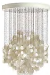
FUN 4DM (1964)

Dimension: Ø56 cm (22.1") / H: 110 cm (43.3") Description: Hanging lamp with one cluster of mother of pearl discs. Attached by chains of small metal rings. Ceiling fitting: White wooden ceiling plate (incl.) Cord: Transparent cord Light source: 220V (110V) E27 (E26) 1 x max. 100W Art.no. EU: 10830606001001, US: 10830606301001