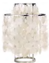
FUN 2TM (1964)

Dimension: Ø27 cm (10.6") / H: 43 cm (16.9") Description: Table lamp with mother of pearl discs on two ring metal frame. Discs are connected with small rings. Ceiling fitting: - Cord: 220 cm (86.6") transparent cord with on/off switch Light source: 220V (110V) E27 (E26) max. 60W Art.no. EU: 20015555011001, US: 20015555311001, GB: 20015555051001