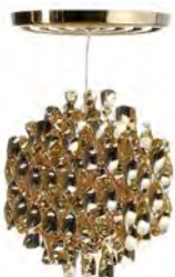
SPIRAL SP1 (1969)

Dimension: Ø48 cm (18.9") / H: 115 cm (45.3") Description: Hanging lamp with one cluster of gold spirals suspended in nylon strings. Ceiling fitting: Gilded ceiling plate (incl.) Cord: Transparent cord Light source: 220V (110V) E27 (E26) max. 100W Art.no. EU: 106936001036, US: 106936301036