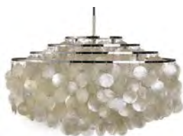
FUN 10DM (1964)

Dimension: Ø57 cm (22.4") / H: 38 cm (14.9") Description: Pendant with mother of pearl discs on four ring metal frame. Discs are connected with small metal rings. Ceiling fitting: Chrome ceiling canopy (incl.) Cord: 400 cm (157.5") black fabric cord Light source: 220 (110V) E27 (E26) 1 x max. 100W Art. no. EU: 11520606001001, US: 11520606301001