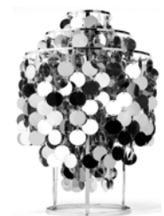
FUN 1TA (1964)

Dimension: Ø40 cm (15.8") / H: 65 cm (25.6") Description: Table lamp with metal discs on three ring metal frame. rings. Discs are connected with small metal rings. Ceiling fitting: - Cord: 220 cm (86.6") transparent cord with on/off switch Light source: 220V (110V) E27 (E26) max. 60W