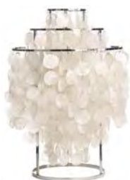
FUN 1TM (1964)

Dimension: Ø40 cm (15.8") / H: 65 cm (25.6") Description: Table lamp with mother of pearl discs on three ring metal frame. Discs are connected with small metal rings. Ceiling fitting: - Cord: 220 cm (86.6") transparent cord with on/off switch Light source: 220V (110V) E27 (E26) max. 60W Art.no. EU: 20025555011001, US: 20025555311001, GB: 20025555051001