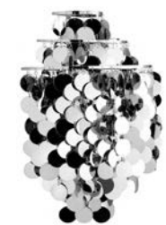
FUN 1WA (1964)

Dimension: Ø40 cm (15.8") / H: 58 cm (22.8") / D: 22 cm (8.7") Description: Wall lamp with metal discs on three ring metal frame. Discs are connected with small metal rings. Ceiling fitting: - Cord: 220 cm (86.6") transparent cord with on/off switch. Light source: 220V (110V) E27 (E26) max. 60W