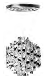
SPIRAL SP1 (1969)

Dimension: Ø48 cm (18.9") / H: 115 cm (45.3") Description: Hanging lamp with one cluster of silver spirals suspended in nylon strings. Ceiling fitting: Silver ceiling plate (incl.) Cord: Transparent cord Light source: 220V (110V) E27 (E26) max. 100W Art.no. EU: 106955001055, US: 106955301055