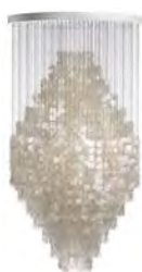
FUN 8DM (1964)

Dimension: Ø100 cm (39.4") / H: 200 cm (78.7") Description: Hanging lamp with one large cluster of mother of pearl discs. Attached by chains of small metal rings. Ceiling fitting: White wooden ceiling plate (incl.) Cord: Transparent cord Light source: 220V (110V) E27 (E26) 3 x max. 100W Art.no. EU: 10640606001001, US: 10640606301001