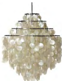
FUN 0DM (1964)

Dimension: Ø53 cm (21.6") / H: 76 cm (31.0") Description: Pendant with mother of pearl discs on four ring metal frame Discs are connected with small metal rings. Ceiling fitting: Chrome ceiling canopy (incl.) Cord: 400 cm (157.5") black fabric cord Light source: 220V (110V) E27 (E26) max. 75W Art.no. EU: 10595555001001, US: 10595555301001