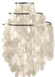
FUN 1WM (1964)

Dimension: Ø40 cm (15.8") / H: 58 cm (22.8") / D: 22 cm (8.7") Description: Wall lamp with mother of pearl discs on three ring metal frame. Discs are connected with small metal rings. Ceiling fitting: - Cord: 220 cm (86.6") transparent cord with on/off switch Light source: 220 (110V) E27 (E26) max. 60W Art.no. EU: 40025555011001, US: 40025555311001, GB: 40025555051001