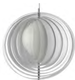
MOON LARGE (1960)

Dimension: Ø44.5 cm (17.5") / H 44.5 cm (17.5") Description: Spherical lamp with vertical lamellae, arranged like a fan, for individual regulation of the light. Metal/white surface. Ceiling fitting: Canopy (incl.) Cord: 250 cm (98.4") white fabric cord Light Source: 220V (110V) E27 (E26) max. 60W Art.no. EU: 1177001001006006011, US: 1177001001006006031