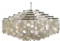
FUN 11DM (1964)

Dimension: Ø70 cm (27.6") / H: 44 cm (17.3") Description: Pendant with mother of pearl discs on five ring metal frame. Discs are connected with small metal rings. Ceiling fitting: Chrome ceiling canopy (incl.) Cord: 400 cm (157.5") black fabric cord Light source: 220 (110V) E27 (E26) 1 x max. 100W Art. no. EU: 11530606001001, US: 11530606301001