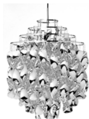
SPIRAL SP01 (1969)

Dimension: Ø45 cm (17.7") / H: 60 cm (23.6") Description: Pendant with silver spirals on four ring metal frame. Spirals are connected to the frame with small metal rings. Ceiling fitting: Chrome ceiling canopy (incl.) Cord: 400 cm (157.5") black fabric cord Light source: 220V (110V) E27 (E26) max. 75W Art.no. EU: 10705555001055, US: 10705555301055