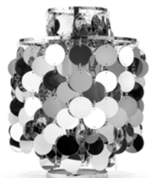
FUN 2TA (1964)

Dimension: Ø27 cm (10.6") / H: 43 cm (16.9") Description: Table lamp with metal discs on two ring metal frame. Discs are connected with small metal rings. Ceiling fitting: - Cord: 220 cm (86.6") transparent cord with on/off switch Light source: 220V (110V) E27 (E26) max. 60W Art.no. EU: 20015555011055, US: 20015555311055, GB: 20015555051055