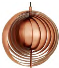
MOON SMALL (1960)

Dimension: Ø34 cm (13.4") / H: 34 cm (13.4") Description: Spherical lamp with vertical lamellae, arranged like a fan, for individual regulation of the light. Metal/copper surface. Ceiling fitting: Canopy copper (incl.) Cord: 250 cm (98.4") black fabric cord Light Source: 220V (110V) E27 (E26) max. 60W Art.no. EU: 1173001001021021011, US: 1173001001021021031