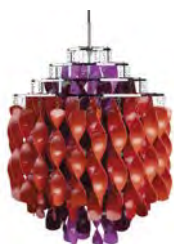
SPIRAL SP01 (1969)

Dimension: Ø45 cm (17.7") / H: 60 cm (23.6") Description: Pendant with coloured spirals on four ring metal frame. Spirals are connected to the frame with small metal rings. Ceiling fitting: Chrome ceiling canopy (incl.) Cord: 400 cm (157.5") black fabric cord Light source: 220V (110V) E27/E26 max. 75W Art.no. EU: 10705555001129, US: 1070555531129