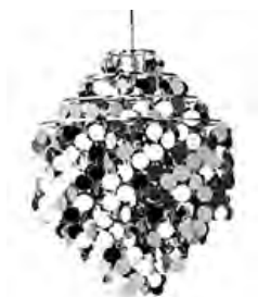
FUN 0DA (1964)

Dimension: Ø53 cm (21.6") / H: 76 cm (31.0") Description: Pendant with metal discs on four ring metal frame Discs are connected with small metal rings. Ceiling fitting: Chrome ceiling canopy (incl.) Cord: 400 cm (157.5") black fabric cord Light source: 220V (110V) E27 (E26) max. 75W