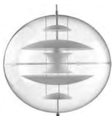
NOT AVAILABLE IN USA VP GLOBE GLASS (1969)

Dimension: Ø40 cm (15.8") Ø50 cm (19.7") Description: Pendant made of transparent acrylic. Five reflectors in opal white glass. suspended by three steel chains Ceiling fitting: Chrome ceiling canopy and Megaman energy saving bulb (incl.) Cord: 400 cm (157.5") white fabric cord Light Source: Ø40 cm (15.8"): 220V (110V) E14 (E12) max. 60W Ø50 cm (19.7"): 220V (110V) E27 (E26) max. 75W Ø40 cm: Art.no. Ø40 cm: EU: 10410000001 Ø50 cm: Art.no. Ø50 cm: EU: 10400000001