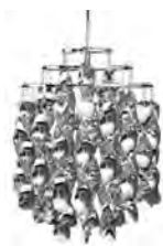
SPIRAL MINI (1969)

Dimension: Ø34 cm (13.4") / H: 55 cm (21.7") Description: Pendant with spirals on three ring metal frame. Spirals are connected to the frame with small metal rings. Ceiling fitting: Chrome ceiling canopy (incl.) Cord: 240 cm (94.5") black fabric cord Light source: 220V (110V) E27 (E26) max. 75W Art.no. EU: 10505555001055, US: 10505555301055