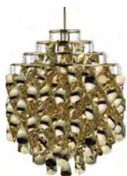
SPIRAL SP01 (1969)

Dimension: Ø45 cm (17.7") / H: 60 cm (23.6") Description: Pendant with gold spirals on four ring metal frame. Spirals are connected to the frame with small metal rings. Ceiling fitting: Gilded ceiling canopy (incl.) Cord: 400 cm (157.5") black fabric cord Light source: 220V (110V) E27 (E26) max. 75W Art.no. EU: 10705555001036, US: 10705555301036