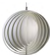
MOON SMALL (1960)

Dimension: Ø34 cm (13.4") / H: 34 cm (13.4") Description: Spherical lamp with vertical lamellae, arranged like a fan, for individual regulation of the light. Metal/white surface. Ceiling fitting: Canopy (incl.) Cord: 250 cm (98.4") white fabric cord Light Source: 220V (110V) E27 (E26) max. 60W Art.no. EU: 1173001001006006011, US: 1173001001006006031