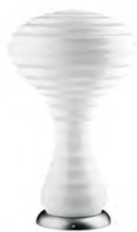
NEW WAVE (1984)

Dimension: Ø22 cm (8,6") / H: 42 cm (16,5") Description: Table lamp in glossy opal white glass with switch on casted matt chrome base. Ceiling fitting: - Cord: 150 cm (59") white fabric cord Light Source: 220V (110V) 2 x E14 max 40W Art.no. EU: 20760101101, US: 207631011, GB: 20760105101