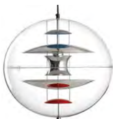
VP GLOBE (1969)

Dimension: Ø40 cm (15.8") Ø50 cm (19.7") Description: Pendant made of transparent acrylic. Five reflectors in hollowed-out aluminium w. laquered finish (white, blue and orange) suspended by three steel chains Ceiling fitting: Chrome ceiling canopy (incl.) Cord: 400 cm (157.5") black fabric cord Light Source: Ø40 cm (15.8"): 220V (110V) E14 (E12) max. 60W Ø50 cm (19.7"): 220V (110V) E27 (E26) max. 75W Ø40 cm: Art.no. Ø40 cm: EU: 10160000001, US: 10160000301 Ø50 cm: Art.no. Ø50 cm: EU: 10010000001, US: 10010000301