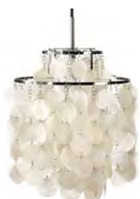
FUN 2DM (1964)

Dimension: Ø27 cm (10.6") / H: 43 cm (16.9") Description: Pendant with mother of pearl discs on two ring metal frame. Discs are connected with small metal rings. Ceiling fitting: Chrome ceiling canopy (incl.) Cord: 400 cm (94.5") black fabric cord Light source: 220V (110V) E27 (E26) max. 60W Art.no. EU: 136055001001, US: 136055301001