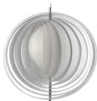
MOON XXXL (1960)

Dimension: Ø150 cm (59.1") / H: 150 cm (59.1") Description: Spherical lamp with vertical lamellae, arranged like a fan, for individual regulation of the light. Metal/white surface. Ceiling fitting: Special requirements for mounting Cord: 250 cm (98.4") white fabric cord Light Source: 220V (110V) E27 (E26) 4 x max. 100W Art.no. EU: 1192001001006006011