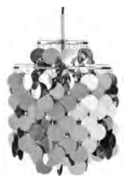
FUN 2DA (1964)

Dimension: Ø27 cm (10.6") / H: 43 cm (16.9") Description: Pendant with metal discs on two ring metal frame Discs are connected with small metal rings. Ceiling fitting: Chrome ceiling canopy (incl.) Cord: 400 cm (94.5") black fabric cord Light source: 220 (110V) E27 (E26) max. 60W