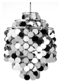
FUN 1DA (1964)

Dimension: Ø45 cm (17.7") / H: 60 cm (23.6") Description: Pendant with metal discs on three ring metal frame. Discs are connected with small metal rings. Ceiling fitting: Chrome ceiling canopy (incl.) Cord: 400 cm (157.5") black fabric cord Light source: 220V (110V) E27 (E26) max. 75W