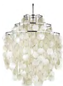
FUN 1DM (1964)

Dimension: Ø45 cm (17.7") / H: 60 cm (23.6") Description: Pendant with mother of pearl discs on three ring metal frame Discs are connected with small metal rings. Ceiling fitting: Chrome ceiling canopy (incl.) Cord: 400 cm (157.5") black fabric cord Light source: 220V (110V) E27 (E26) max. 75W Art.no. EU: 10605555001001, US: 10605555301001