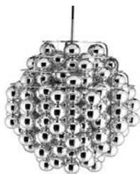
BALL SILVER (1969)

Dimension: Ø44 cm (17.3") Description: Pendant with round balls on four ring metal frame Ceiling fitting: Chrome ceiling canopy (incl) Cord: 400 cm (157.4") black fabric cord Light Source: E27 max. 60W Art.no. EU: 10065555011, US: 10065555301